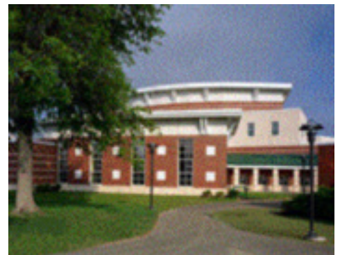
Performing Arts Center, Duxbury, MA Orchestra performances