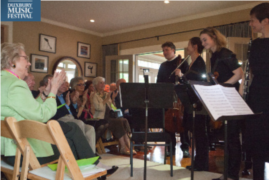
A recent chamber music concert in Duxbury performed by the faculty of South Shore Conservatory

It all began in 1970 when a small group of determined citizens gathered in a Cohasset living room to ensure that the South Shore would continue to have a school that provided excellent music education for its children and for generations to come. The New England Conservatory was about to close its Hingham satellite, and in its place, a new organization began to emerge, dedicated to the mission of providing access to excellence in music and arts education for the entire South Shore community.