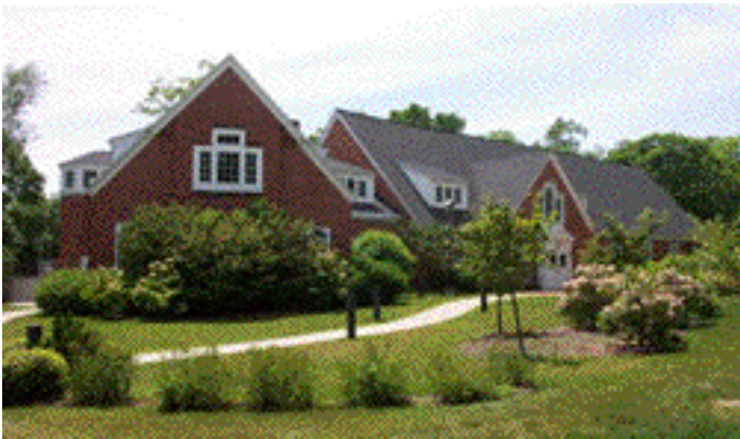
Ellison Center for the Arts, Duxbury, MA Solo and chamber music performances